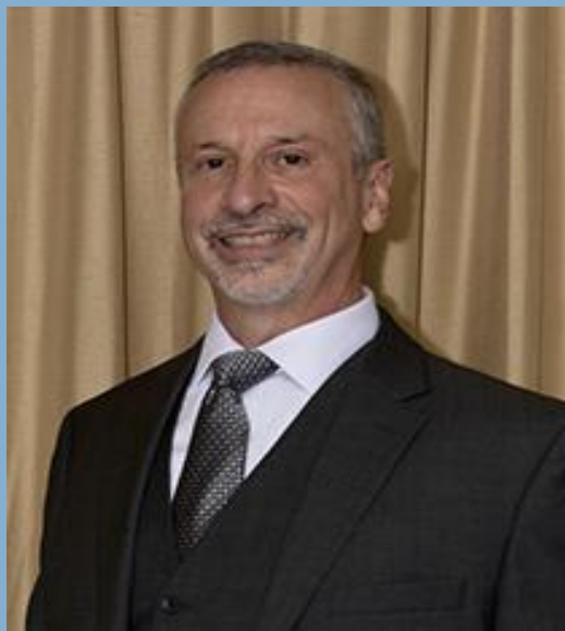
Mentors Coordinator & Tech Specialist